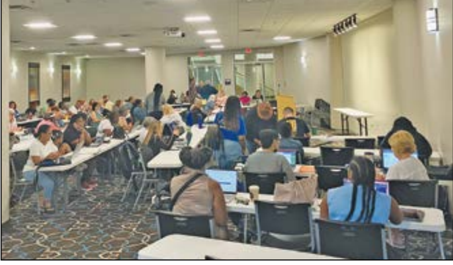
CTU phone bank callers attended training sessions during the summer.