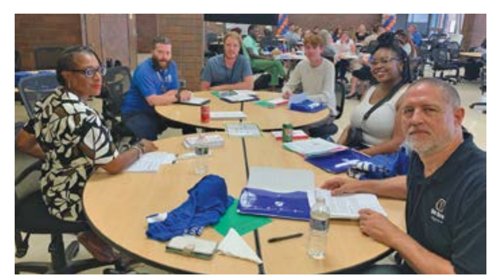
CTU welcomed our newest members at CMSD's New Teacher Orientation.

part of a community with its own marketplace, AFT+ Member Benefits, that combines the purchasing power of AFT's 1.7 million members with the benefit offerings of Union Plus, the AFL-CIO's benefits branch. AFT+ provides an array of discounts, services, and benefits that go beyond the workplace. Many of these programs are available to family members, too.